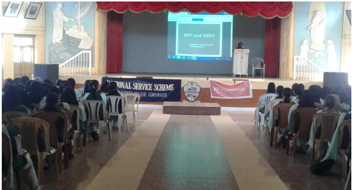
The AIDS Day pledge also was taken