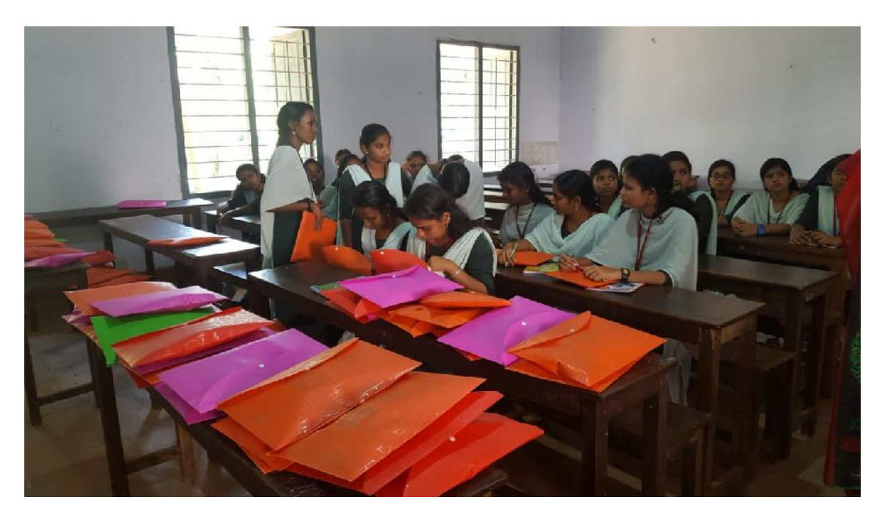
Student Kit distribution

The kit was distributed on 10.12.2019 and the first ASAP class was also held for the 2<sup>nd</sup> year SSP students. After the student kit distribution, the 1<sup>st</sup> external mentoring session for the 1<sup>st</sup> years was arranged. The session was led by Ms. Anitta S. Cheeran.