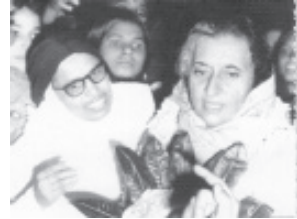
Visit of Mrs. Indira Gandhi during the Silver Jubilee Year