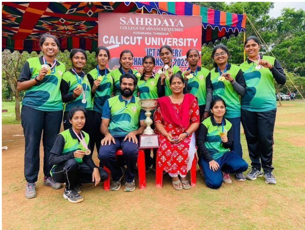
Inter Collegiate Archery Championship held at Sahridhaya College of Advance Studies Kodakara on 8 th & 9 th December. Our team secured team championship.