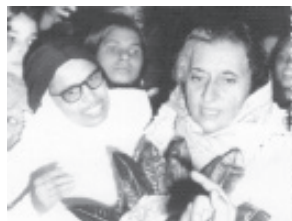
Visit of Mrs. Indira Gandhi during the Silver Jubilee Year