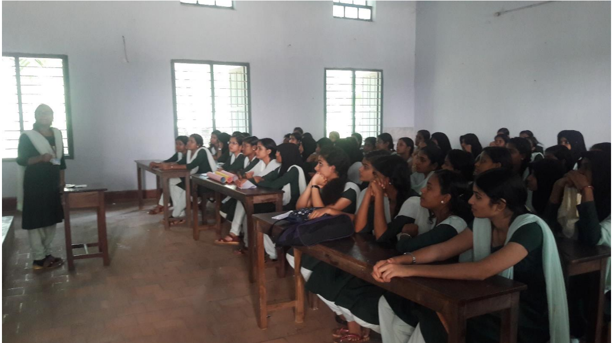
SHORT FILM LINK

https://drive.google.com/file/d/0By8z7fGi0U1KbGtzaGFSeENUQ2s/view?usp=drivesdk