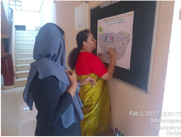
Feb 2, 2023 12:01:15 Mammiyoor Guruvayur Kerala