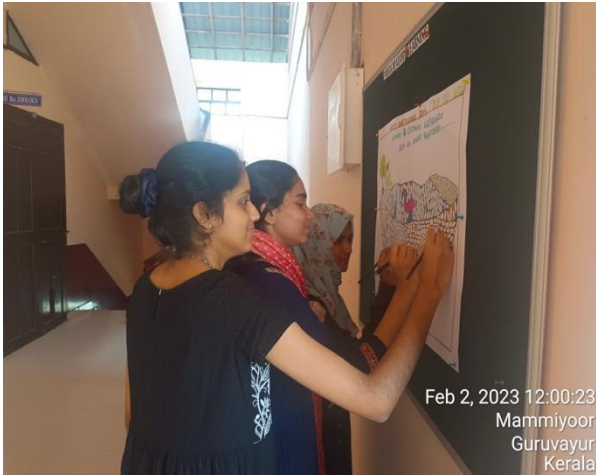
Feb 2, 2023 12:00:23 Mammiyoor Guruvayur Kerala