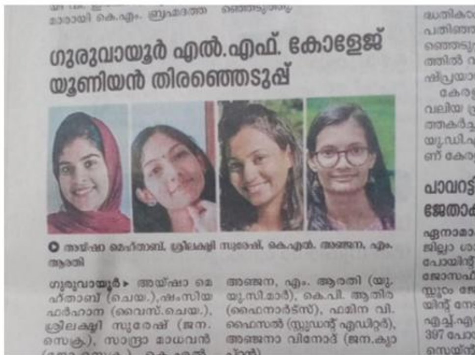
The Little Flower college election mentioned in the Mathrubumi newspaper at 2nd November 2023