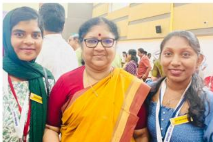
Meeting with Minister of Higher Education