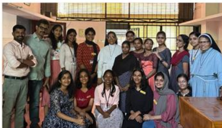
At LF Rehabilitation Centre