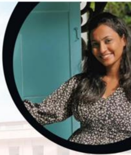
UUC ANJANA .K.L COLLEGE UNION LITTLE FLOWER COLLEGE GURUVAYUR