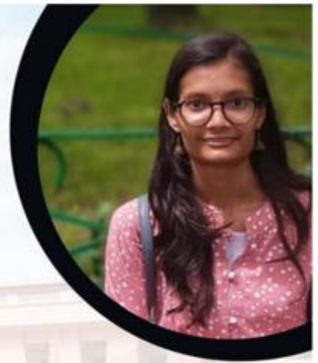
UUC ARATHI.M COLLEGE UNION LITTLE FLOWER COLLEGE GURUVAYUR