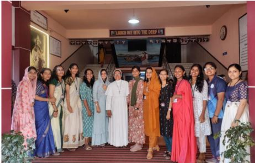
After the election is conducted and the results are declared