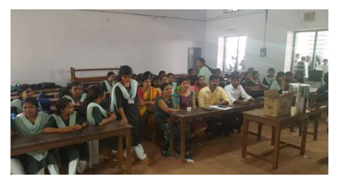
Refreshment for students with internal and external mentors