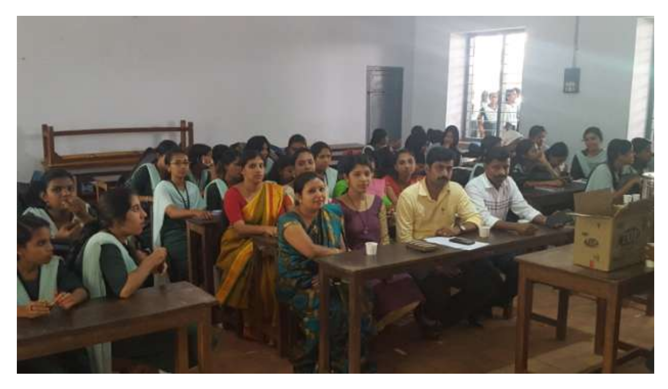
Refreshment for students with internal and external mentors