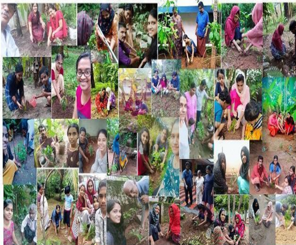
World Environment Day Campaign - "Planting a fruit tree sapling with your family"

On the same day planting of fruit tree sapling was carried out by all the students of the department. The photos were collected and a video on the programme was released. 80 students and their parents participated in the program and their list with the name of fruit saplings were collected by the department.